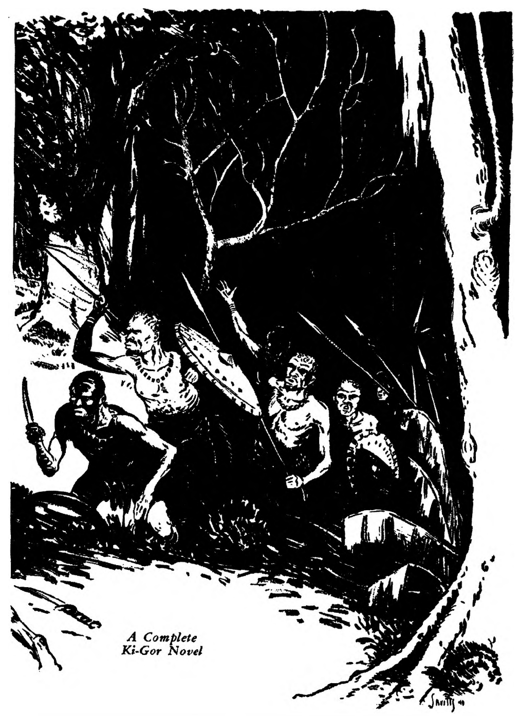
The jungle seethed with terror. Devilish rumors flew the vine-route: Ki-Gor was doomed! The vile Wandarobo, hordes of stunted beastmen, had trapped the blond stalker. . . . And copper-haired Helene, the tree-telegraph whispered, would die beneath the cannibal moon!

their hands shielded their eyes from the pelting rain. The girl pushed a dank auburn strand of hair off her white forehead and sighed.